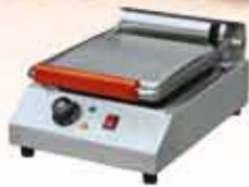
Contact Grill Npl1g