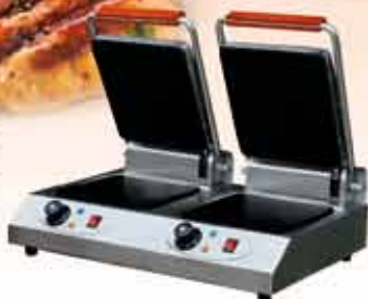
Contact Grill Npl2g