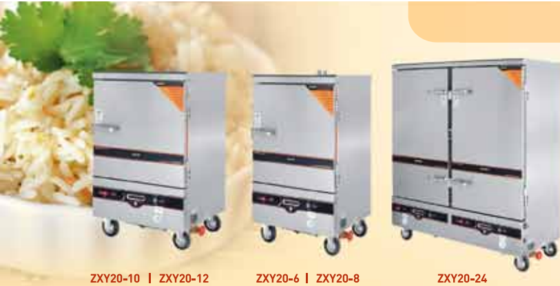
ZXY20-10 | ZXY20-12