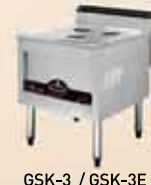
GSK-3 / GSK-3E