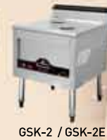
GSK-2 / GSK-2E