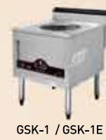
GSK-1 / GSK-1E