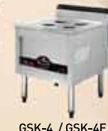
GSK-4 / GSK-4E