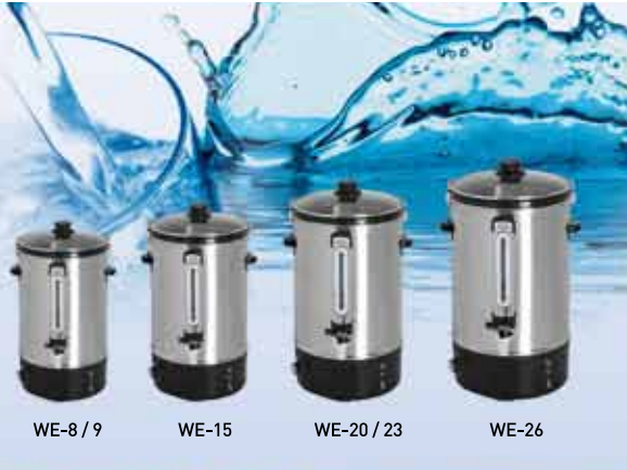
WE-8 / 9