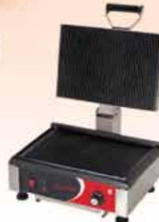
Two Side Grill Npl-1r