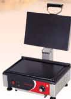
Two Side Grill Npl-1d